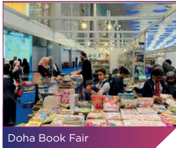
Doha Book Fair