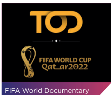
FIFA World Documentary