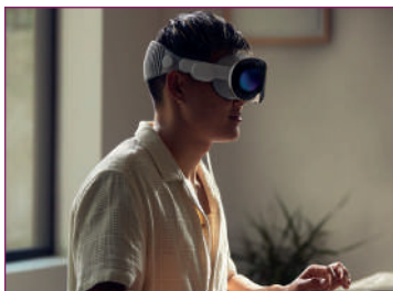
Apple launches "Vision Pro"