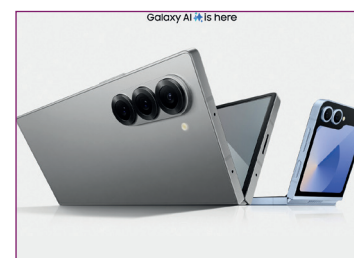
Samsung Unveils Galaxy Z Fold 6