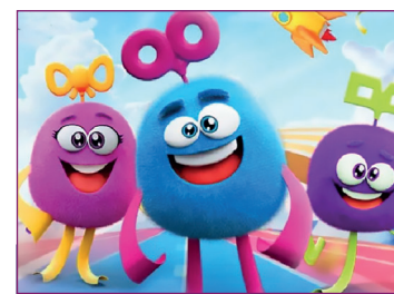
Qatar Toy Festival-2025