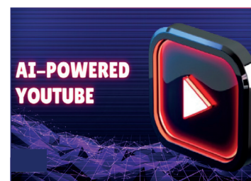
YouTube Begins Testing Ai-Powered Thumbnails