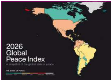
Qatar tops MENA in the Global Peace Index 2026.