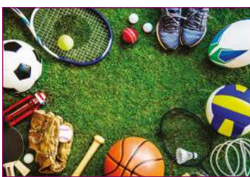
Global Sports Highlights