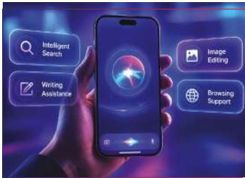
Apple Intelligence and Siri AI