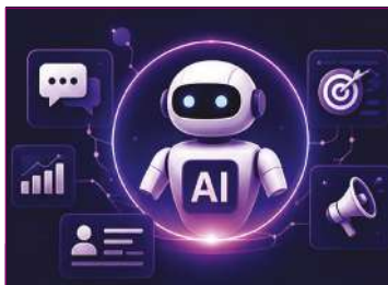
Finyal Educational Insight